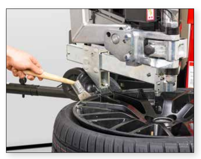
Rollers discs assist bead lubrication and ease demounting.