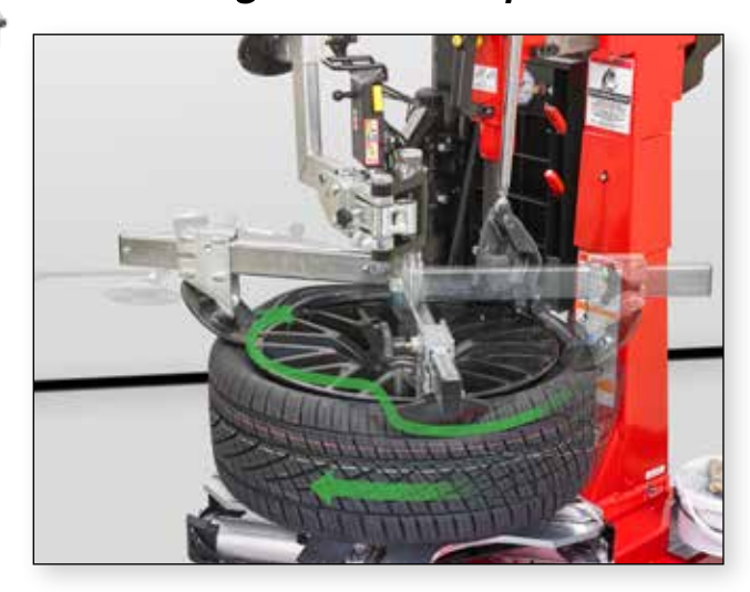
Rising cam actionreduces bead stress on top bead mount.