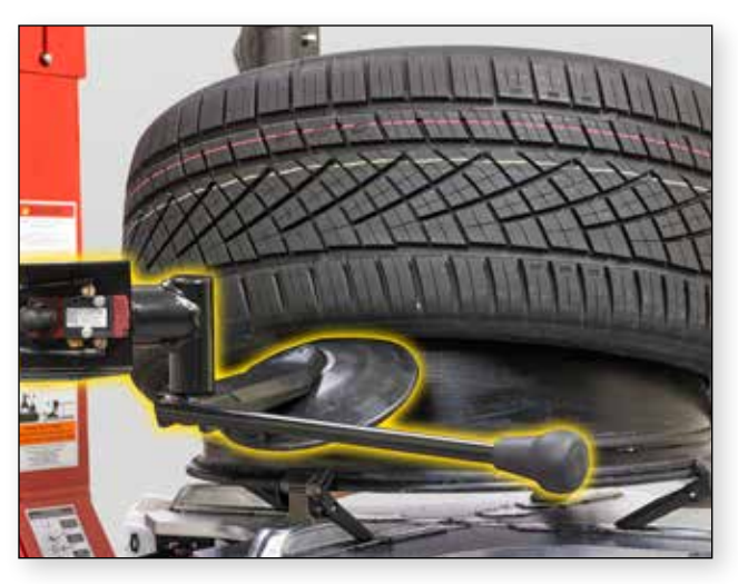
The bottom roller disc can be used for bottom bead reloosening, demounting or match mounting.