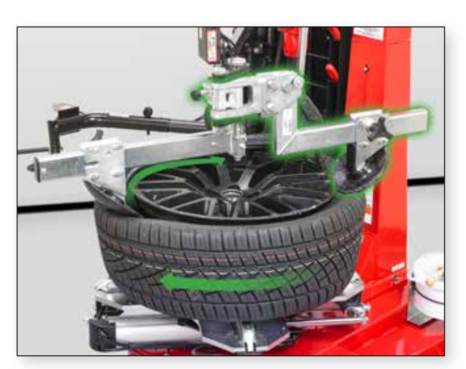
The flip down, fixed bead press arm adds additional contact to service the most extreme low-profile tires and deep drop-center wheels.