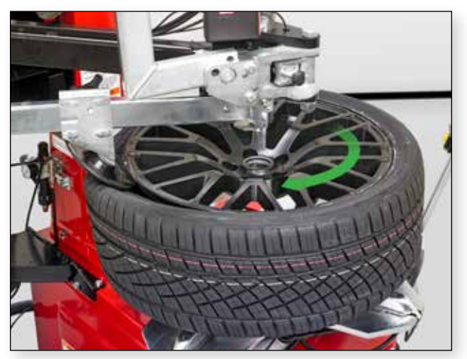
A single bead press roller disc can quickly assist mounting and demounting stiff sidewall tires.