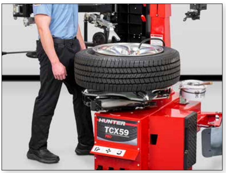
Nozzle is securely mounted to Bead Press carriage, allowing completely hands free operation.