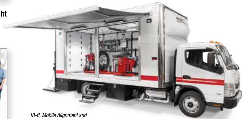
18-ft. Mobile Alignment and Wheel Service Box Truck shown