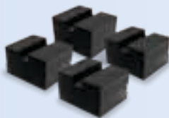
Four 4 1/8" spotting block auxiliary adapters Part#: 63100

For more information, contact your Authorized Challenger Lifts Distributor: