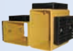
4 two position adapter blocks included Part#: SR10-001