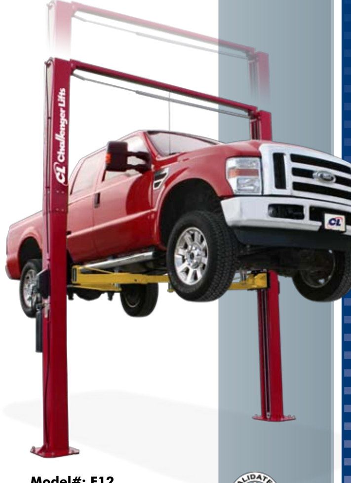
Model#: E12 Heavy-Duty Symmetric 2-Post Lift 12,000 lb. capacity