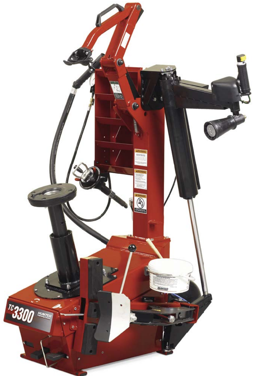
Model TC3305 shown